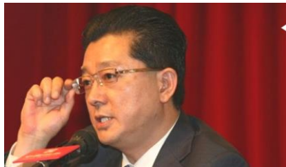
China Overseas Land issues 600 million euro bonds [learn mandarin] Jul 27, 2015