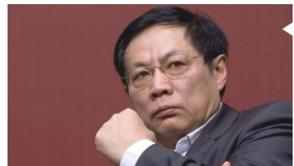
China Real Estate Crowd Funding: Hua Yuan Property & Noah Jul 22, 2015