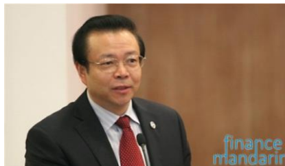
Lai Xiaomin, Huarong IPO $1.6bn - biggest Asset Manager in PRC: Cornerstone Investors October 16, 2015