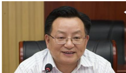
One belt one road- TMT Finance in Chinese: CRSC IPO fully subscribed Jul 29, 2015