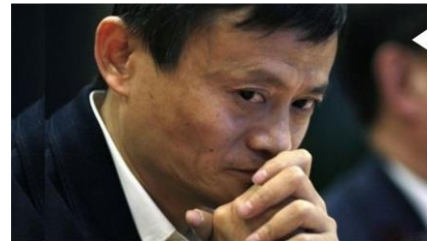
Alibaba's Tmall - Duty-Free Shopping Online [learn Chinese] July 30, 2015