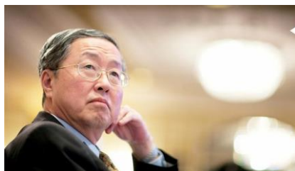
PBoC cuts RRR; 140 billion in SLO, how does it work? August 27, 2015