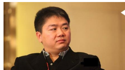
Tiger Fund picks up JD; Soros drops Alibaba & Baidu August 18, 2015