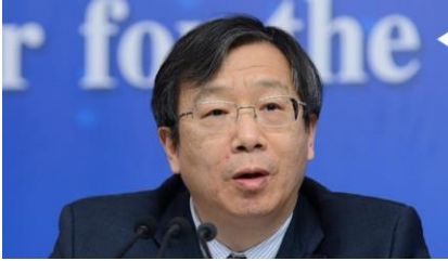
Yi Gang, SAFE: RMB 10% Devaluation to stimulate Export? Nonsense August 14, 2015