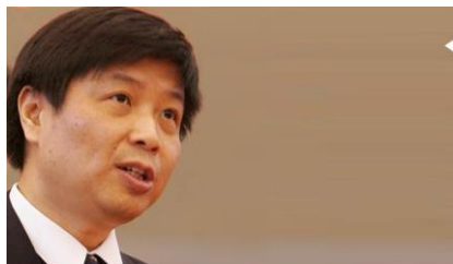
CICC Plan second-half IPO in HK Jul 23, 2015