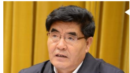
China Rising: SINOPEC #2 in Global Fortune 500 [learn mandarin] Jul 28, 2015