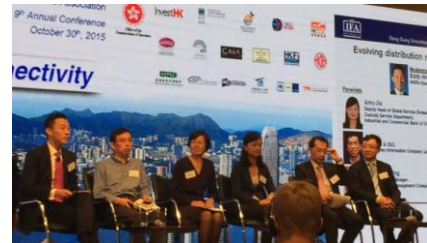
Media Training for Asset Management: Fund Recognition Panel in Business Mandarin October 31, 2015