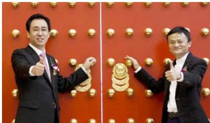
1st China Football Team IPO: Story of Jack Ma & Xu Jiayin November 9, 2015