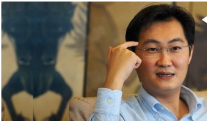
Tencent & Evergrande enter O2O [learn Chinese] August 4, 2015