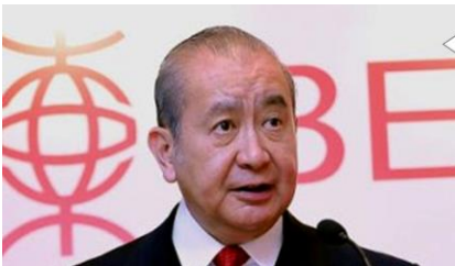
Does On-line Lending work in China? WeBank & BEA partner for online Jul 28, 2015