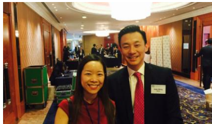
Media Training Success, JPMorgan Asset Management Story November 4, 2015