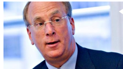
BlackRock further into China US$400M QFII Quota September 8, 2015