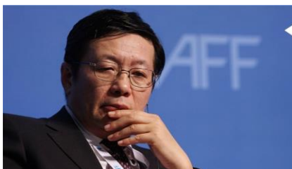
Lou Jiwei: China GDP remains 7% from 3-4 years September 7, 2015