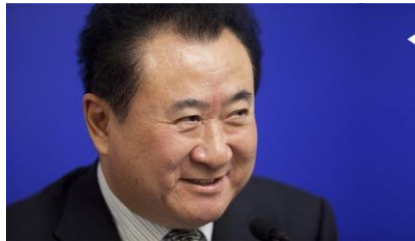
Wanda pushes into Tourism, Aviation [PPP learn Chinese] August 3, 2015