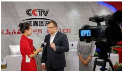
Media Training in Business Mandarin: IPO, M&A, Roadshows, Global Investment Summit October 28, 2015