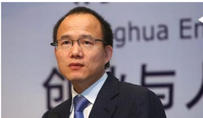
China's Warren Buffet 郭广昌 buys Milan Bank Headquarters Jul 29, 2015