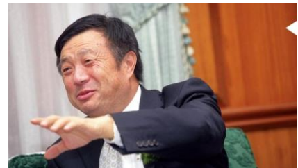
Huawei mobile revenue 7.2 billion [learn mandarin] Jul 24, 2015